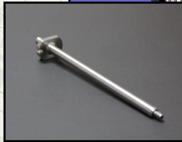
Pumps and dispenses high-viscosity materials